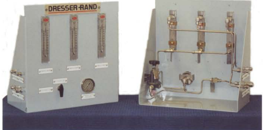
Custom Pneumatic/Instrument Panels