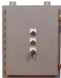
Motor Starter Panel