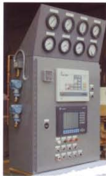
Pneumatic/Electrical Control Panel