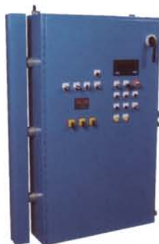
Machine Control Panel