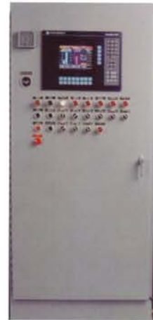
Control Panel w/HMI